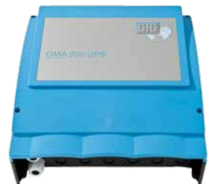
Redundant power supply in IP-65 wall-mounted housing: GMA 200-UPS