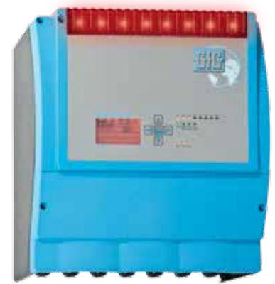
GMA 200-MW in IP-65 wall-mounted housing