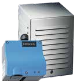
CC 22 with weather protection

A weatherproof housing not only protects transmitters against exposure to wind and weather, but also against contamination and excessive temperatures caused by direct sunlight.