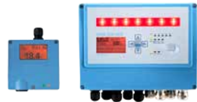
EC 22 Transmitter and GMA 200-MW4 Controller

The embedded software of the EC 22 linearizes the measuring signal and compensates for the effects of temperature. As a result, correct readings are transmitted even with weather related fluctuations in temperature. In addition, the transmitter also offers the option of transmitting service, maintenance, and error messages to a connected gas measuring computer.