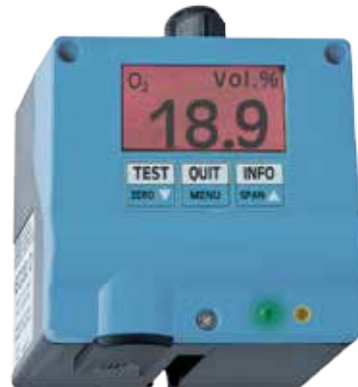
Graphical display with control buttons and horn