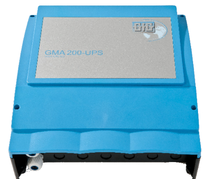
Redundant power supply in IP-65 wall-mounted housing: GMA 200-UPS