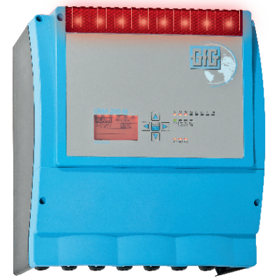
GMA 200-MW in IP-65 wall-mounted housing