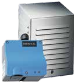
CC 22 with weather protection

A weatherproof housing not only protects transmitters against exposure to wind and weather, but also against contamination and excessive temperatures caused by direct sunlight.