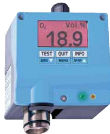
Graphical display with control buttons