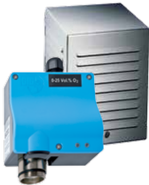
ZD 22 with weather protection

A weatherproof housing not only protects transmitters against exposure to wind and weather, but also against contamination and excessive temperatures caused by direct sunlight.