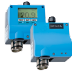
ZD 22 Transmitter with display and no display

There are a variety of applications for the ZD 22 in regard to sensors, status LEDs and optional analog or digital interface, "Zero" key to calibrate the zero point, test socket and a potentiometer for the calibration of the sensor.